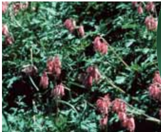
The delicate and sweetly scented Bleeding Heart is a woodland delight.