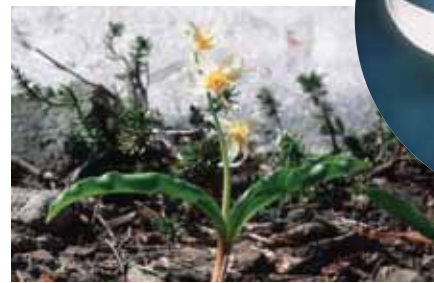
Fawn Lily appears just as the crystals of snow melt into rivulets of water.