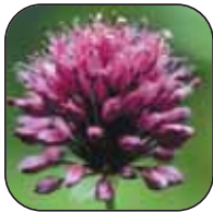
Garlic Allium sativum

Positive qualities: Resilient and vital response to life, active resistance to adverse influences