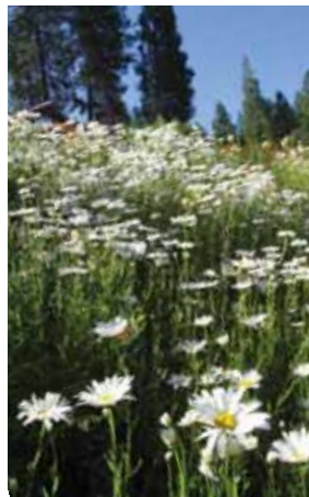
Abundant Shasta Daisies shine at summer solstice.