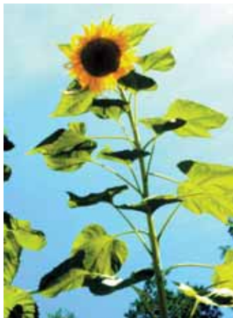
The towering Sunflower celebrates the high summer sun.