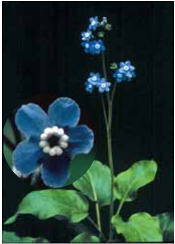
The bright blue Hound's Tongue emerges from the dense vegetation of the forest floor in early spring.