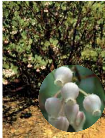
The strong Manzanita brings life to disturbed habitats.