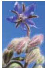
Brilliant blue Borage flowers bring a cheerful uplifting presence to the garden.