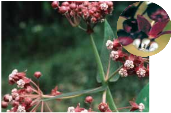
Home to butterflies, the Milkweed grows in the forests near riverbanks.