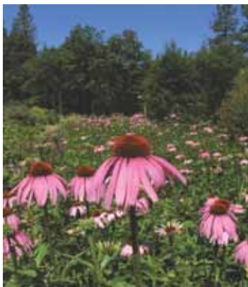
Strong and radiant Echinacea rays its mantle of magenta light into the garden.