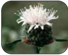
Mountain Pennyroyal Monardella odoratissima

Positive qualities: Strength and clarity of thought, mental integrity and positivity