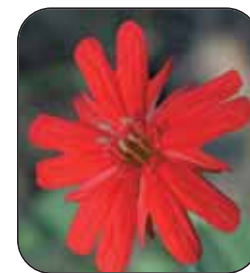
Indian Pink Silene californica

Positive qualities: Ability to remain centered and focused, even under stress or high levels of activity; managing and coordinating diverse tasks