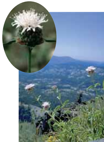
Mountain Pennyroyal wafts its cleansing aroma from mountain sentinels.