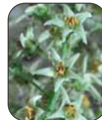
Poison Oak Toxicodendron diversiloba

Positive qualities: Positive vulnerability, ability to make contact with others through touch