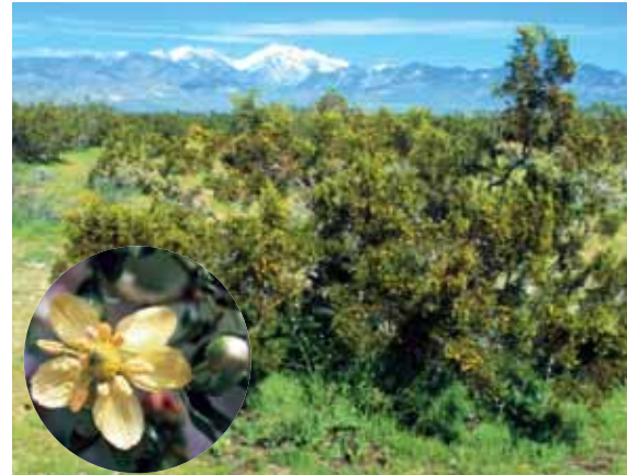
The pungent and purifying Chaparral (Creosote Bush) flourishes in the high deserts.