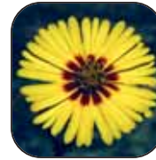
Madia Madia elegans

Positive qualities: Precise thinking, disciplined focus and concentration