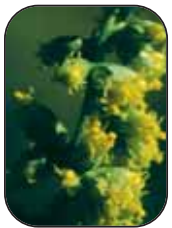
Mugwort Artemisia douglasiana

Positive qualities: Integration of psychic or dream experiences with daily life; flexible, multi-dimensional consciousness, warm and expansive soul qualities