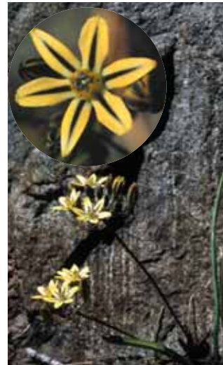
Pretty Face shines its luminous star in alpine meadows.