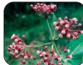
Milkweed Asclepias cordifolia

Positive qualities: Healthy ego strength; independence and self-reliance