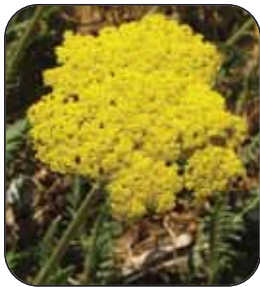
Goldenrod Solidago californica

Patterns of imbalance: Over-sensitivity to one's social surroundings, resulting in social isolation, or a false social persona; dependence on drugs for protection or social masking