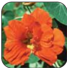
Nasturtium Tropaeolum majus

Positive qualities: Glowing vitality, radiant warmth; living thinking