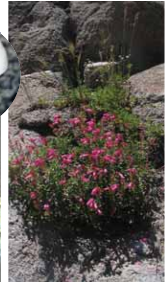
Mountain Pride flames from its rocky ledge perch.