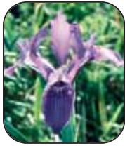
Iris Iris douglasiana

Positive qualities: Inspired artistry, soulful creativity in touch with higher realms; radiant, iridescent vision in all aspects of life