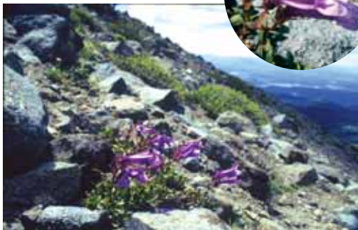
Penstemon grows sturdily above the tree-line in the crevices of volcanic rock.