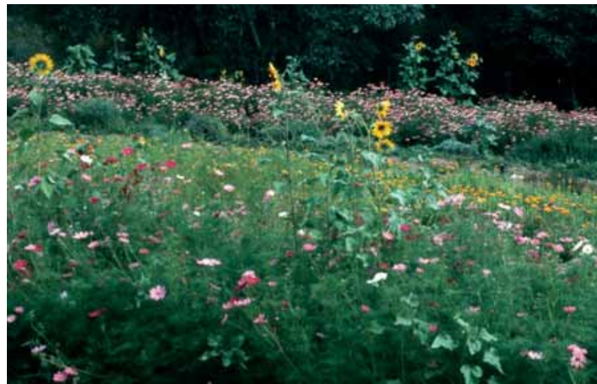
The Terra Flora Biodynamic Gardens