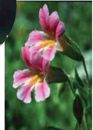
Pink Monkeyflower nestles into the curving streams of mountain snowmelt.