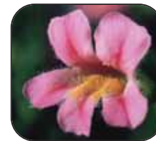
Pink Monkeyflower Mimulus lewisii

Positive qualities: Emotional transparency; courage to take emotional risks with others