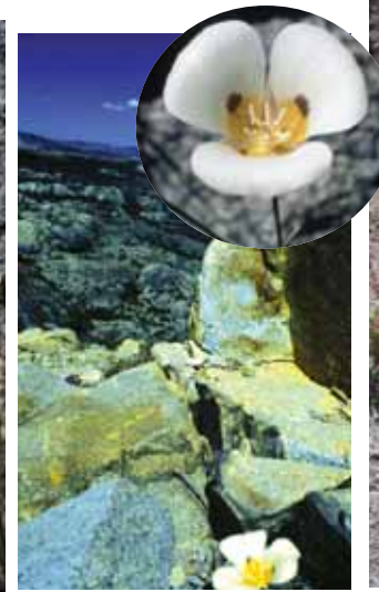
The gentle chalice of Mariposa Lily flourish in the granite rocks of the high Sierras.