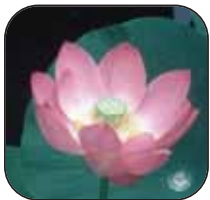
Lotus Nelumbo nucifera

Positive qualities: Expansive and inclusive spirituality, ability to synthesize diverse life experience in service to the spiritual world