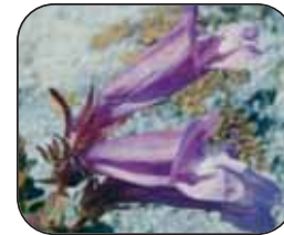
Penstemon Penstemon davidsonii

Positive qualities: Inner fortitude despite outer hardships; perseverance; ability to endure and forbear adversity