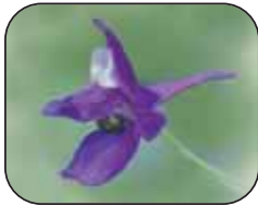
Larkspur Delphinium nuttallianum

Positive qualities: Charismatic leadership, contagious enthusiasm, joyful service