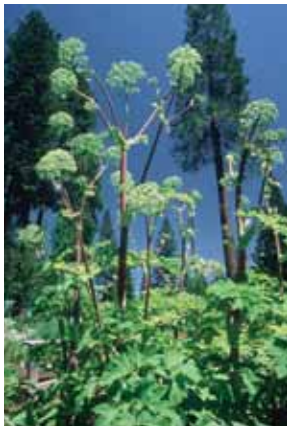
The bright white globes of Angelica offer a prayer to the sky.