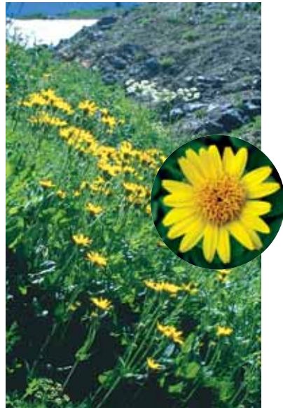
Sun-kissed Arnica blooms along the streams of freshly melting snow.