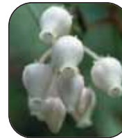
Manzanita Arctostaphylos viscida

Positive qualities: Joyous embodiment, spiritual identity integrated with the physical body