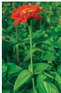
Zinnia blossoms with red exuberance.