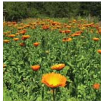
Golden curving cups of Calendula grace the garden most of the year.