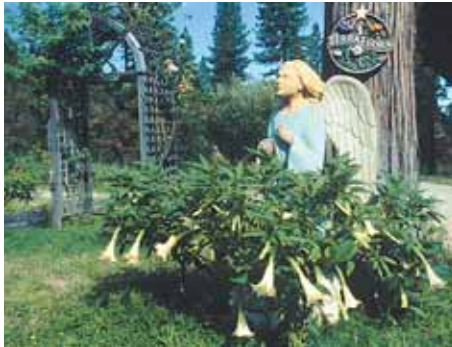
Angel's Trumpet growing by the Terra Flora angel.