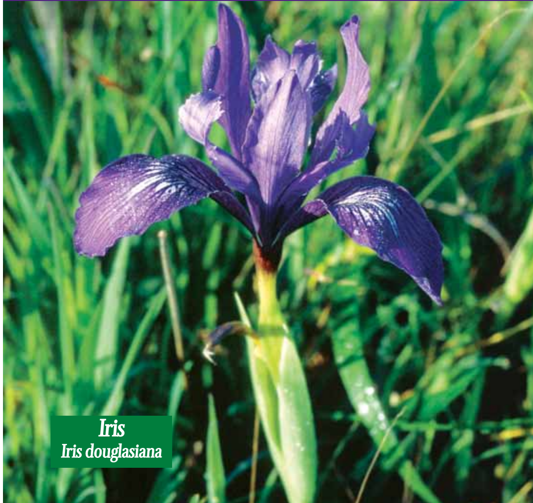
Iris Iris douglasiana

Iris stimulates creativity, there's nothing like it! It started me writing again, after ten years of inactivity. I've used it successfully ever since.