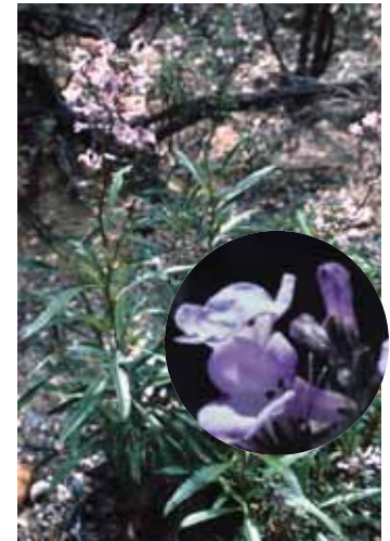
Filled with oily resin, the delicate lavender Yerba Santa (above) favors dry, exposed hillsides.