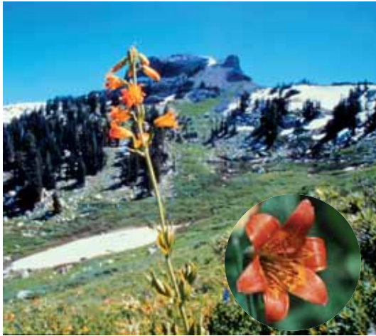
The majestic Alpine Lily graces high mountain meadows.