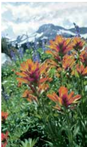
Indian Paintbrush adds a vibrant accent to a moist mountain meadow.