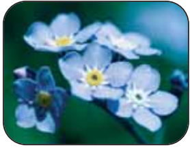
Forget-Me-Not Myosotis sylvatica

Positive qualities: Awareness of karmic connections in one's personal relationships; perceptive mindfulness of subtle realms and transpersonal relationships